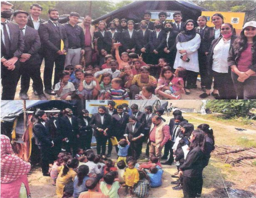
Visit of Legal Aid Camp on “Awareness on Good Touch and Bad Touch” at Bahlolpur Village, New Delhi, 29 th November, 2021

Plot No. 32, 34, Knowledge Park-III, Greater Noida- 201306, UP