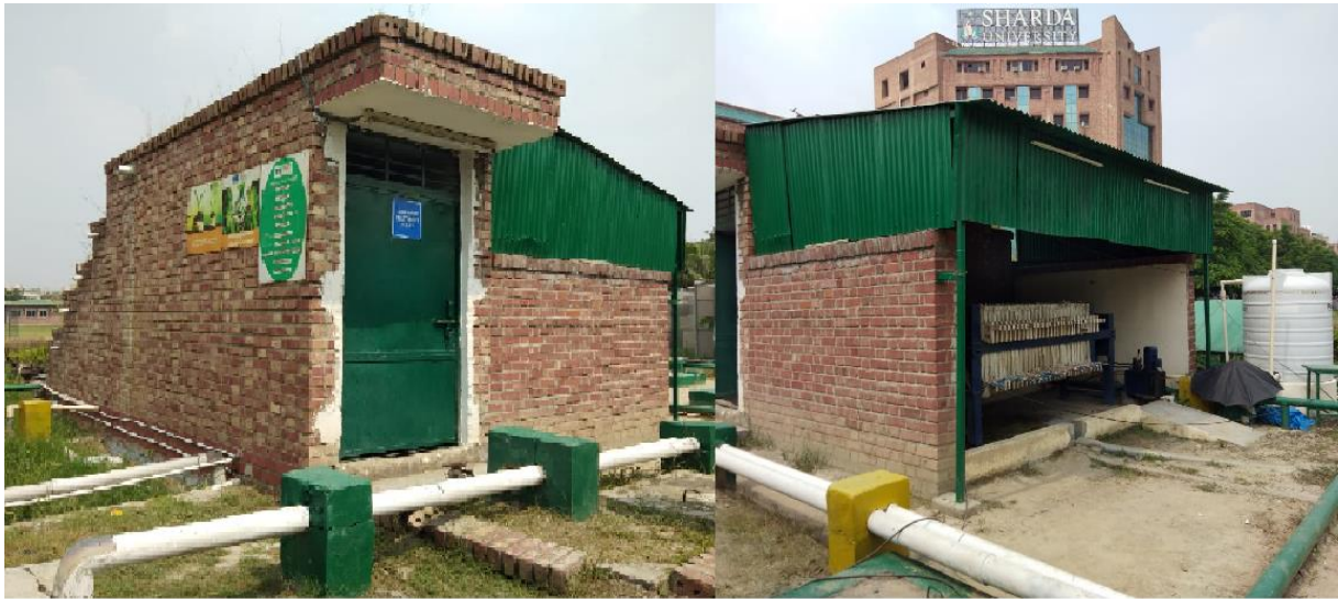
STP (Sewage Treatment Plant)