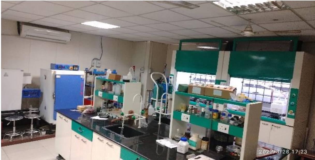
Fig. Labs equipped with fume hood