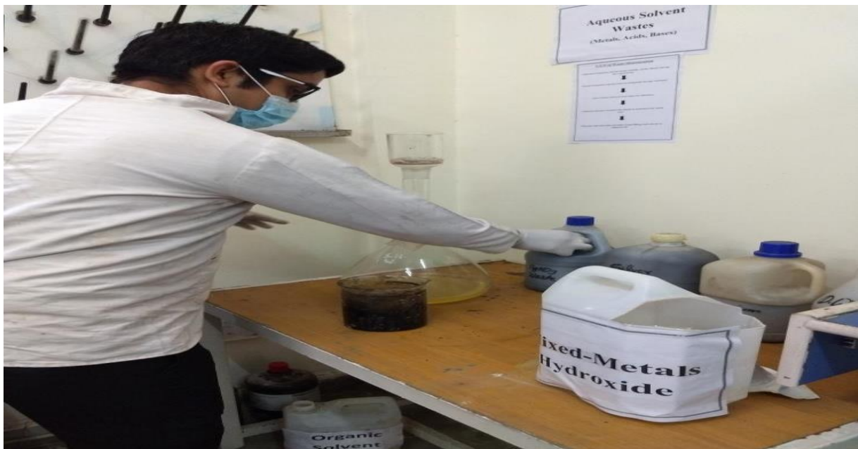
Fig. Safe handling of waste