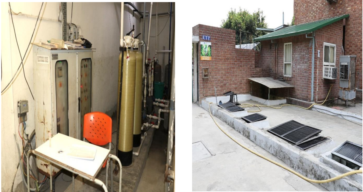
ETP (Effluent Treatment Plant)