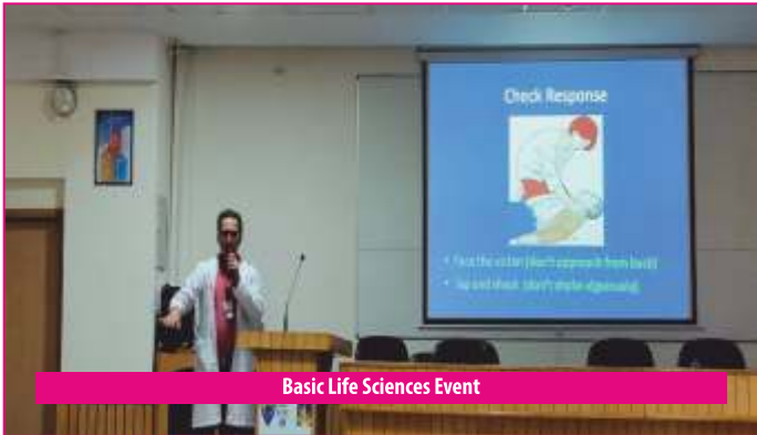
Basic Life Sciences Event