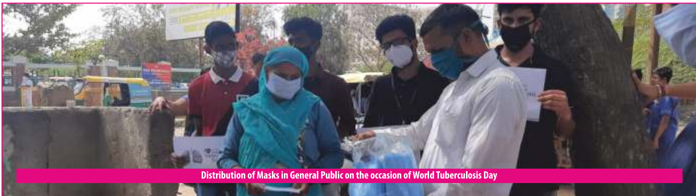
Distribution of Masks in General Public on the occasion of World Tuberculosis Day