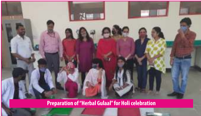
Preparation of "Herbal Gulal" for Holi celebration