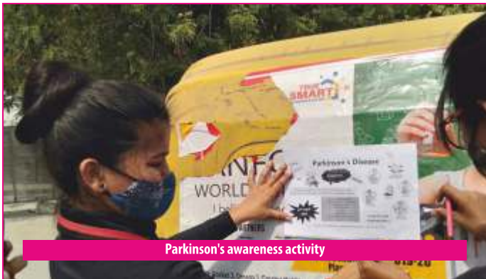
Parkinson's awareness activity