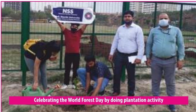
Celebrating the World Forest Day by doing plantation activity