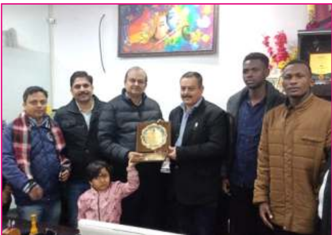
Students visited various reputed corporates like (Scott Edil Pharmacia, NDB Healthcare, Sigma Softgel, Fresenius Cabi Oncology Ltd., Alkem Laboratories & Cachet Pharmaceuticals)