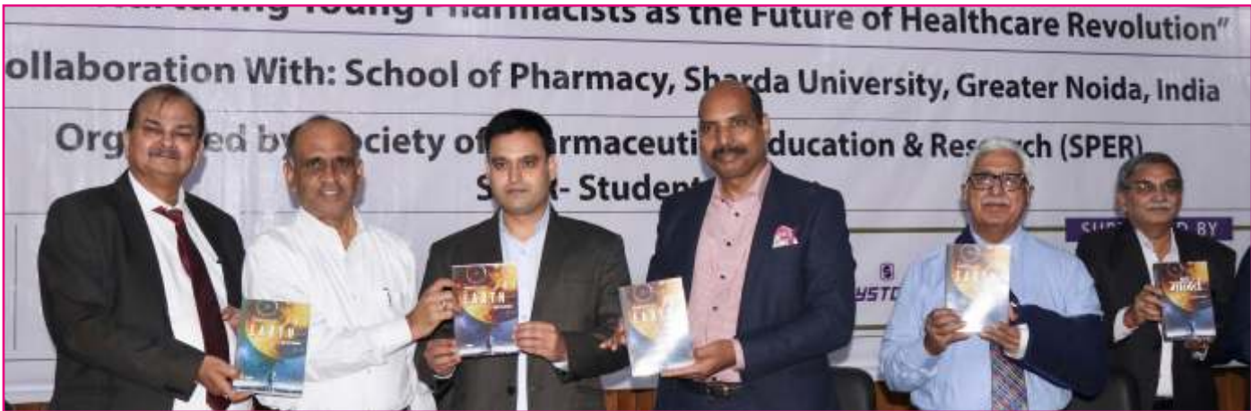
SPER Student Congress organized by School of Pharmacy on 2nd November 2019