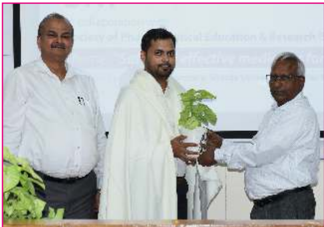
World Pharmacist Day 2019