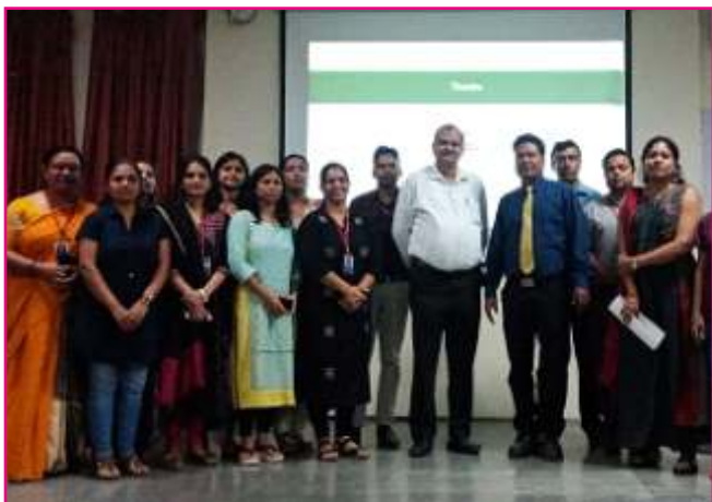
Guest lecture by International Speaker