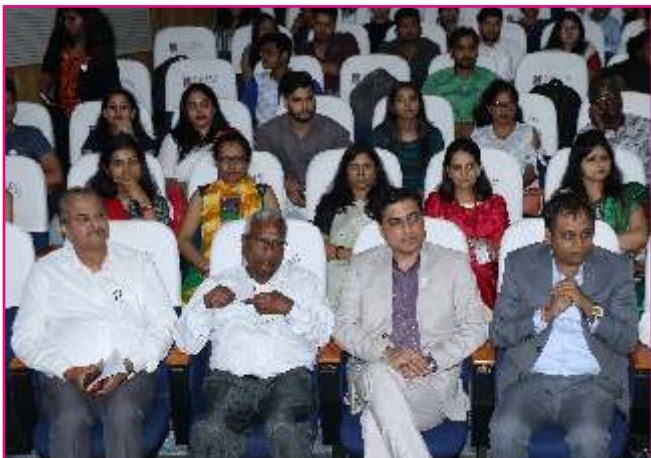
World Pharmacist Day 2019