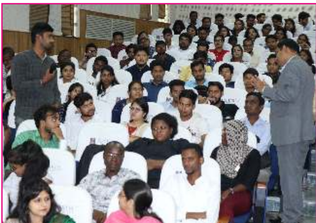
World Pharmacist Day 2019