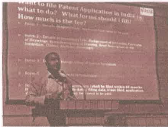
Figure 2 Mr. Shalendra delivering the keynote address