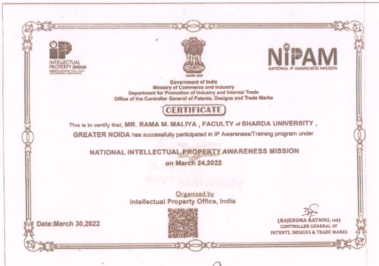
Figure 5: Sample Certificate

Internal Quality Assurance Cell (IQAC) SHARDA UNIVERSITY Plot No. 32-34, Knowledge Park - III Greater Noida-201308