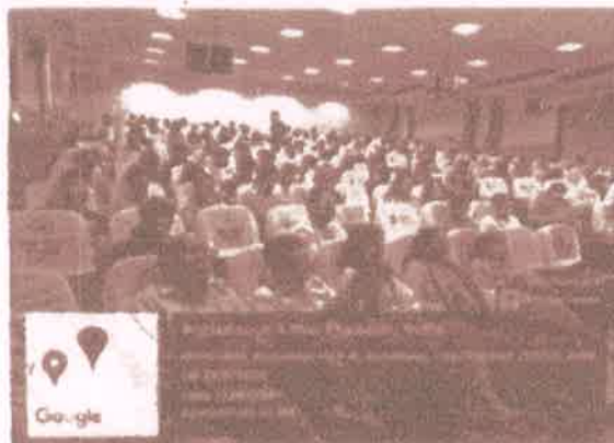
Figure 1 Participants attending workshop