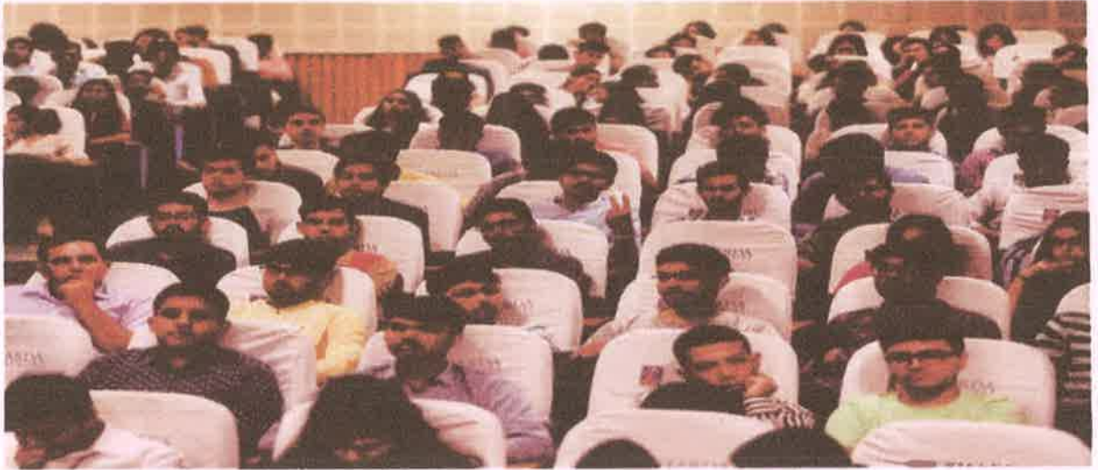
Students are paying attention in the orientation programme