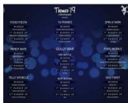
SUFYAN FROM MUSIC SOCIETY BIT BOXING WINNER