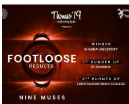
IIT ROORKEE THOMSO'19 DANCE GROUP OF SHARDA UNIVERSITY