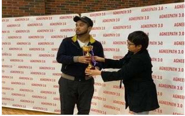
ICSL GALGOTIA University, Greater Noida