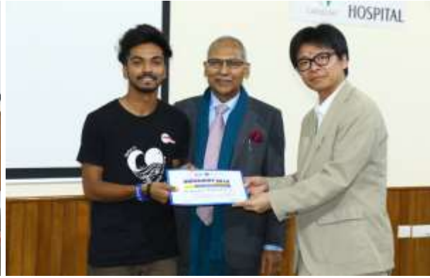
C.S Students Certificate Received From Dignitaries