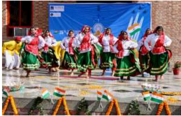
Cultural Activities in National School India Cup Football Championship 16 th February 2019: cultural activities conducted in Inauguration for National India School Football championship which was held in Sharda University.