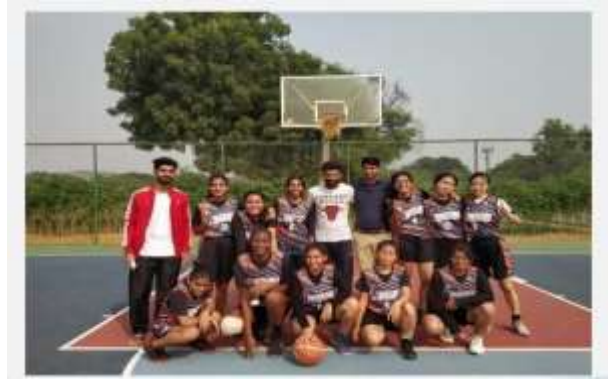
CONVERGE, JAYPEE INSTITUTE