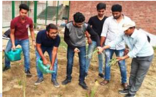
Ek Deep Shahidon Ke Naam-(25 th January 2019)