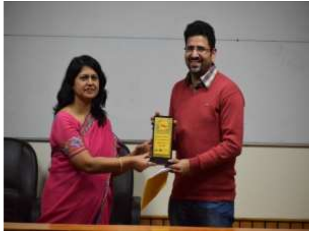
Faculty Organizing team Chorus 2017