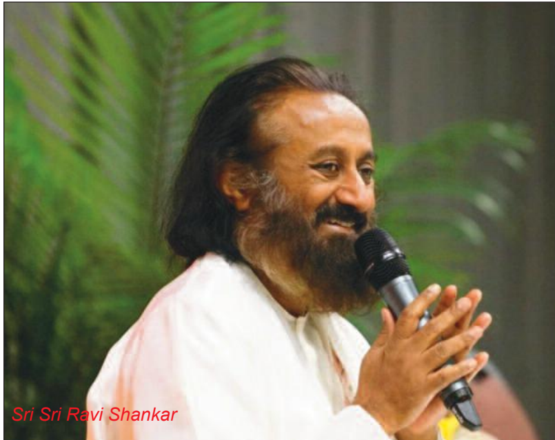
Sri Sri Ravi Shankar

The presence of Sri Sri Ravi Shankar has generated considerable interest in the event. People are eager to listen the special lecture that he is going to deliver on the occasion. Popularly referred to as Sri Sri, the spiritual guru is the recipient of Padma Vibhushan, the second highest civilian award given by the Government of India. In 1981, he founded the Art of Living Foundation, which aims to relieve individual stress, societal problems, and violence. In 1997, he established a Geneva-based charity, the International Association for Human Values, an NGO that engages in relief work and rural development.