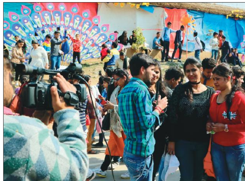
ON THE JOB: Mass Communication students make a documentary at the Surajkund Mela

We indeed had a great time enjoying the drum-beats to listen to, having a tummy full of delicious food and a great time at the joyous rides. It was undeniably a stupendous experience.