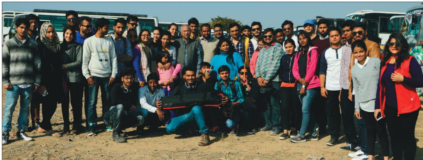
FOR THE RECORD: Students and faculty members at Surajkund in Faridabad.

SURAJKUND, Faridabad: The Department of Mass Communication organised an educational trip to Surajkund Mela (fair) on February 10. It was aimed at helping the students understand cultural and traditional aspects of India and other nations. It gave them an opportunity to put their theoretical