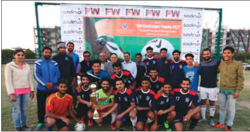
OWNER'S PRIDE: Sharda's Football team with runner-up trophy at O.P. Jindal, Sonipat

But the real fight was with the arch rivals Amity University. The final was played between Sharda and GGSIPU