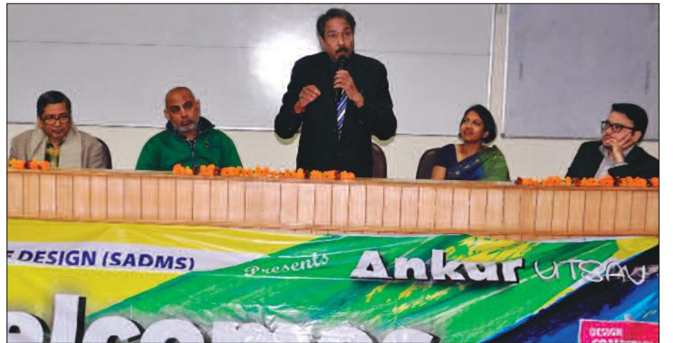
Design experts at a discussion during Ankur Utsav. (Below) Schoolteachers were felicitated as visitors enjoyed the exhibition.

It proved to be a highly successful and celebrated event.