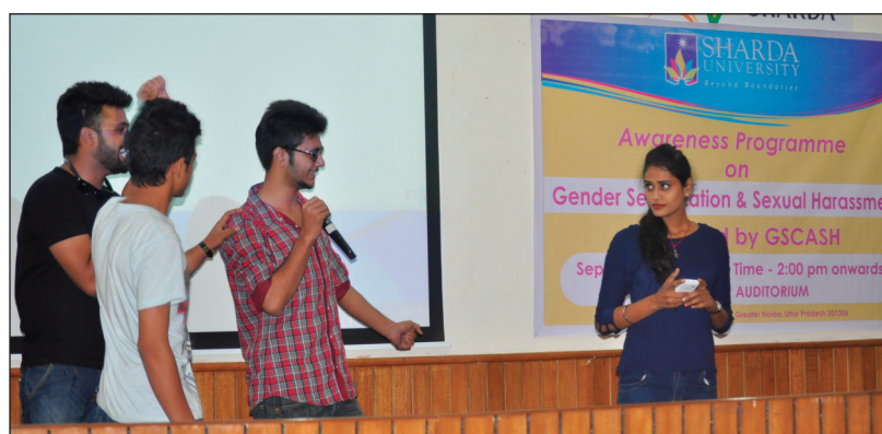
Natya Kriti, the drama club of Sharda University, presented a skit highlighting sexual harassment.

He said women don't get equal status as men and are usually referred to as dependable. "It is socially acceptable for a husband to physically abuse his wife. We need to address these issues. The will to change is there, but something substantial needs to be done."