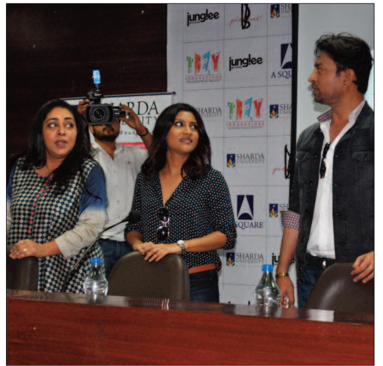
Excited students click photos of Vishal Bhardwaj, Meghna Gulzar, Konkana and Irrfan Khan in an interactive session at the School of Law.

be the culprits. They have been convicted for the murders by lower court.