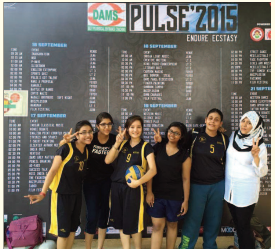
Dental students jubilant after winning the volleyball tournament

The SBS has so far won the doubles and single in badminton and single in volleyball. The School of Dental Sciences has won both single and doubles badminton (girls). The School of Engineering and Technology has won the volleyball tournament.