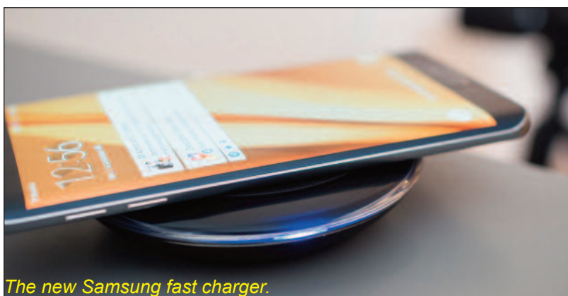
The new Samsung fast charger.

In the years to follow, irrespective of time, place and situation one thing would remain the same forever - my gratitude towards whatever I learned at Sharda University.