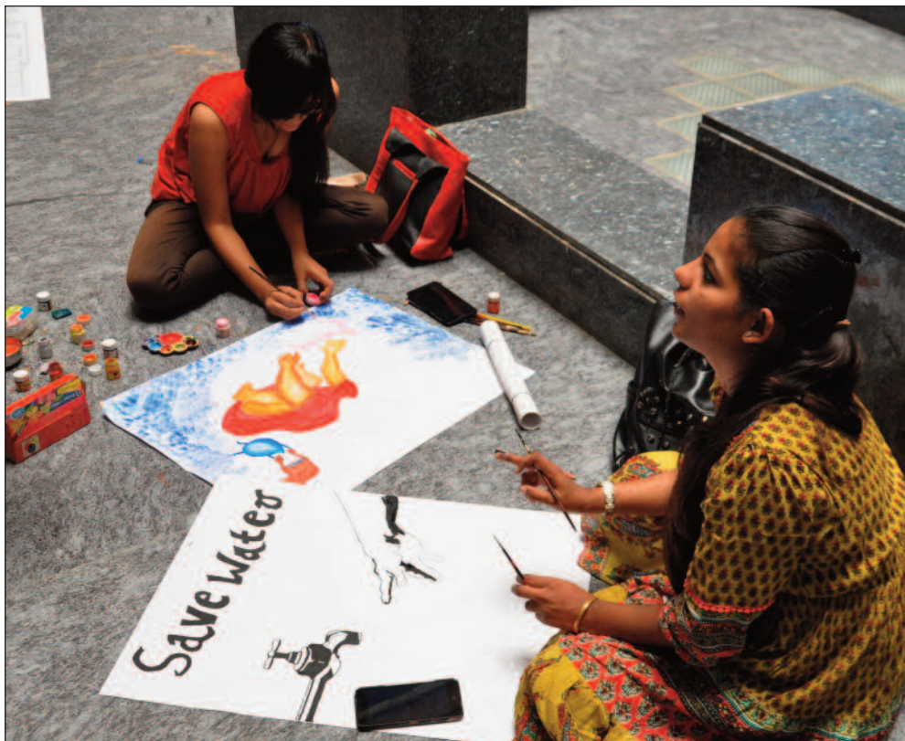
Schoolchildren participate in the painting competition organised by SBSR. (More pictures on Page 2)