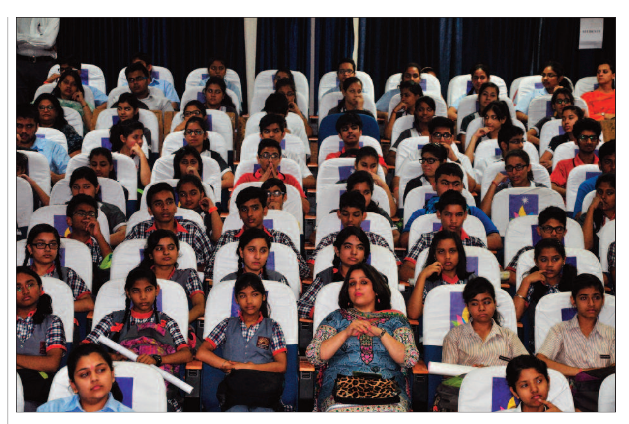
Participants from Greater Noida schools at Earth Day-2016 celebrations.

This installation was based on 'Make in India' concept, a contemporary approach of Indian artists to make international client aware of the capabilities of Indian designers to uplift the Indian economy