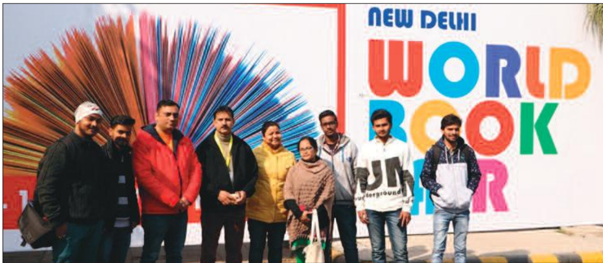
Faculty members and students at the World Book Fair