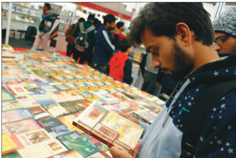
SCANNING THE BOOKS: A Mass Communication student at one of the stalls at Pragati Maidan.