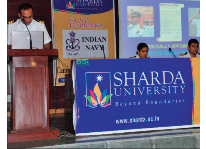
IN SEARCH OF TALENT: Indian Navy officers address students during recruitment process in Sharda University..

those seeking to become an officer in Navy should have certain basic attributes such as good leadership qualities, effective intelligence and willingness to serve the nation.