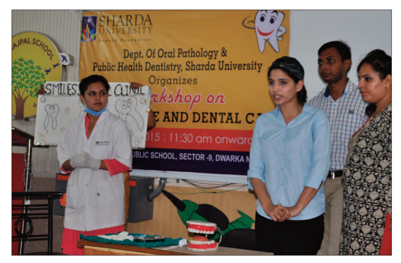
SCHOOL OUTREACH PROGRAMME: The Department of Oral pathology & Public Health Dentistry of Sharda's School of Dental Sciences organised a workshop on 'Oral Hygiene and Dental Care' at R.D. Rajpal Public School in Dwarka, New Delhi, on Aug. 20. It was held as part of World Hygiene Week.

The university is abuzz with chirp of new birds on the branches of knowledge. It's time to explore the campus and make new friends.