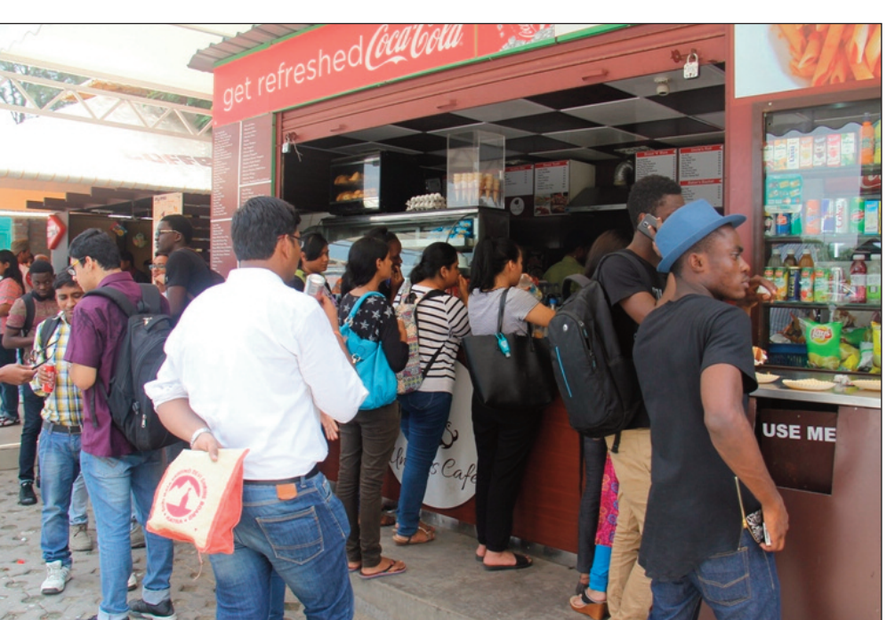
both national and BACK TO LIFE: Grabbing a bite taking time out of the packed schedule of classes. international

Our lives are like clay, we have to mould it and shape up our future. At Sharda University we get a platform to showcase our talents and discover ourselves. It is rightly said 'The world is here at Sharda University' and so here I am!