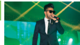
Punjabi singer Guru Randhawa Performing in Chorus 2017

The annual media fest of Mass communication Department of Sharda University "Media Mela" was organized on 15th and 16th March 2018, different events like PTC, Ad mad show, RJ hunt, Short film competiton, Debate competiton added up to the glare of Media Mela. Bollywood's renowend director Mr. Mahesh Bhatt was the center of attraction of this edition of Media Mela. Mr. Bhatt and his team featured a play focusing on the life of an IAS aspirant and the challenges of his life.