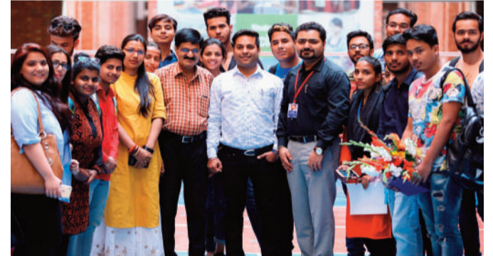
Guest lecturer from Star TV network confronted the students of Mass communication in the Friday lecture series.