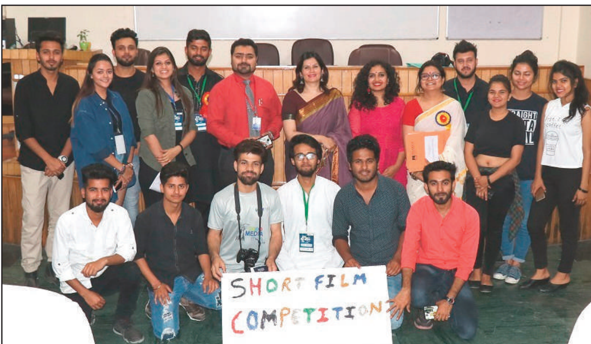
Short Film competition participants with Judges