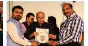
Mr. Mahesh Bhatt being honoured