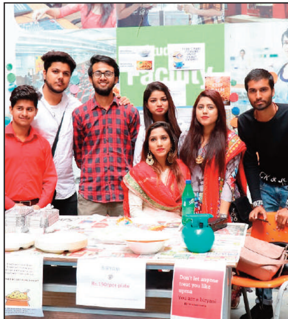
Delicious food stalls by students