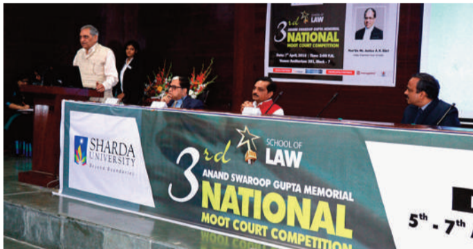
School of Law organized a 3 day Anand Swaroop Gupta Memorial moot court competition