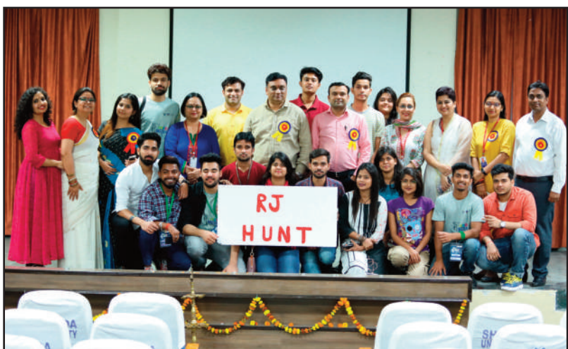
Participants with Faculty members in RJ Hunt competition