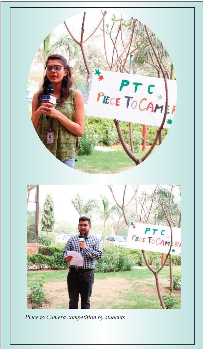
Piece to Camera competition by students