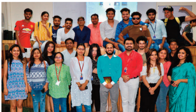
Guest lecturer from Panasonic India had a session on photography with the students of Mass Communication