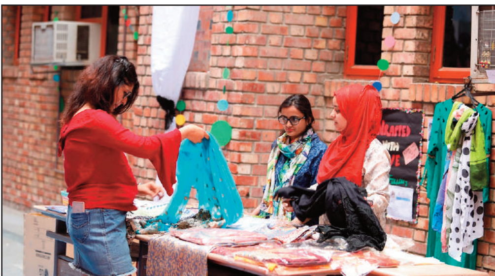
Students enjoying a little shopping spree