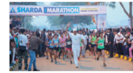
Runners of Sharda Marathon