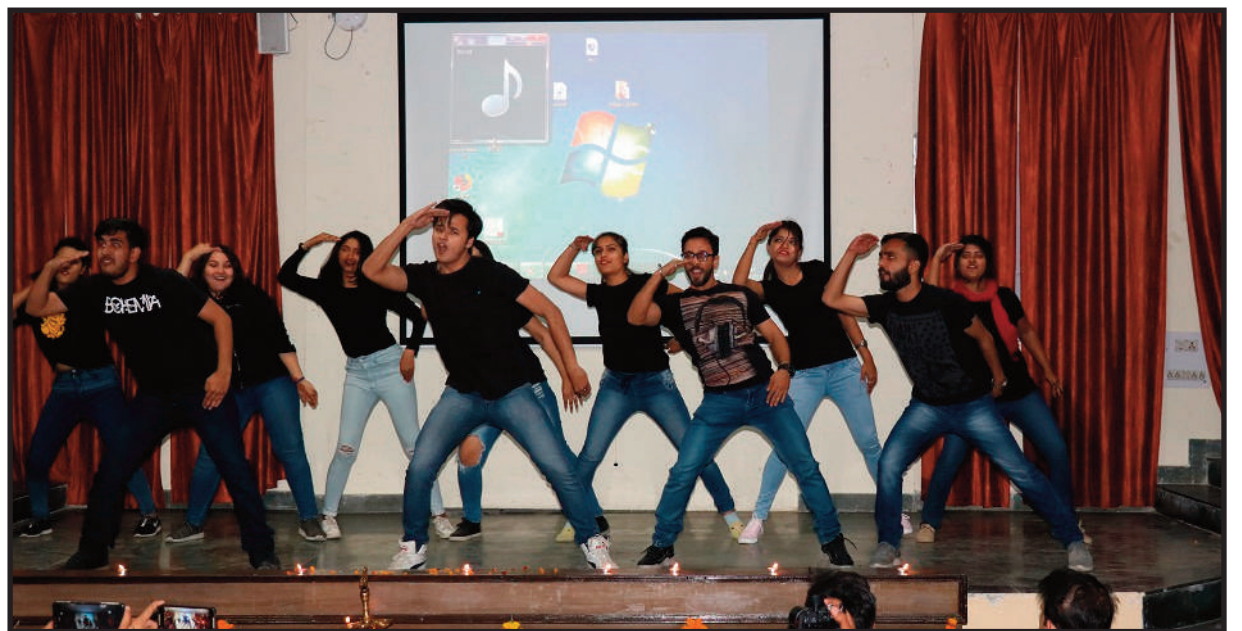
Group dance performance by MA and BA students of Mass Communication