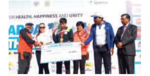
Winners of Marathon