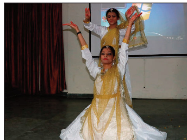
Cultural performance in Media Mela 2K18