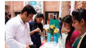
Stalls in Media Mela

Sharda University's famous event chorus unveiled on 9th November 2017, to add flare to this event, renowend International and National artists