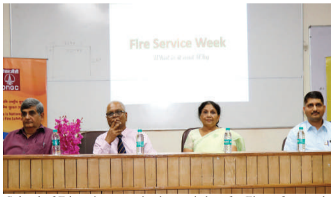
School of Education organized a workshop for Fire safety on the occasion of Fire Service Week