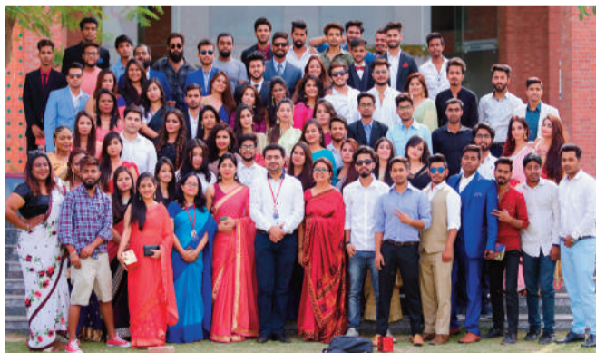
Mass communication department bids farewell to its senior batch of UG and PG programmes