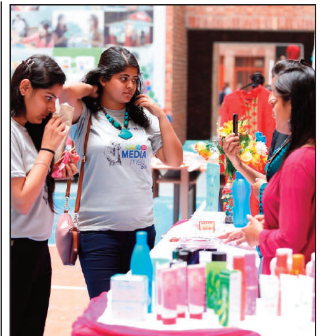
Students trying out products at the stalls