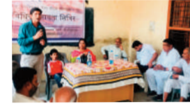
Glimpses of Legal ad camp

On 13th March 2018, Sharda University organized a Legal ad camp, whose prime focus was to educate and aware people about the laws of FIRs, arrests, Dowry, Child marriage and other governmental schemes like "Beti Bachhao Beti Padhao", Bhim UPI etc.