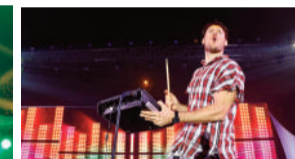
Australian DJ Rave Radio performing in Chorus 2017