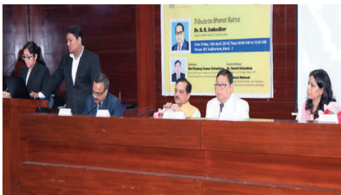
School of Law paid tribute to the Bharat Ratna Awardee Dr. Bhim Rao Ambedkar.