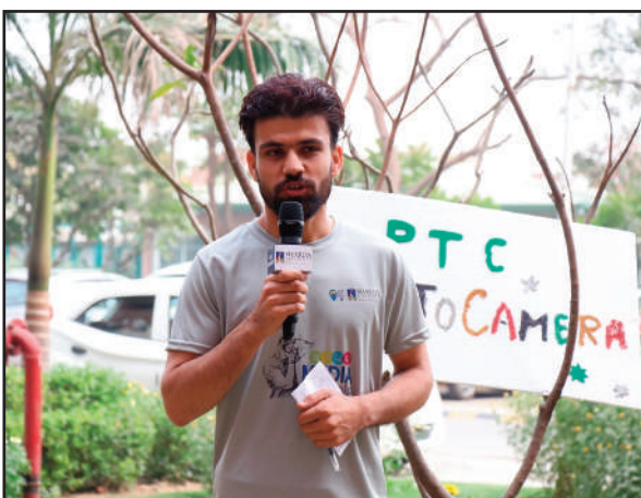
A participant of PTC Event