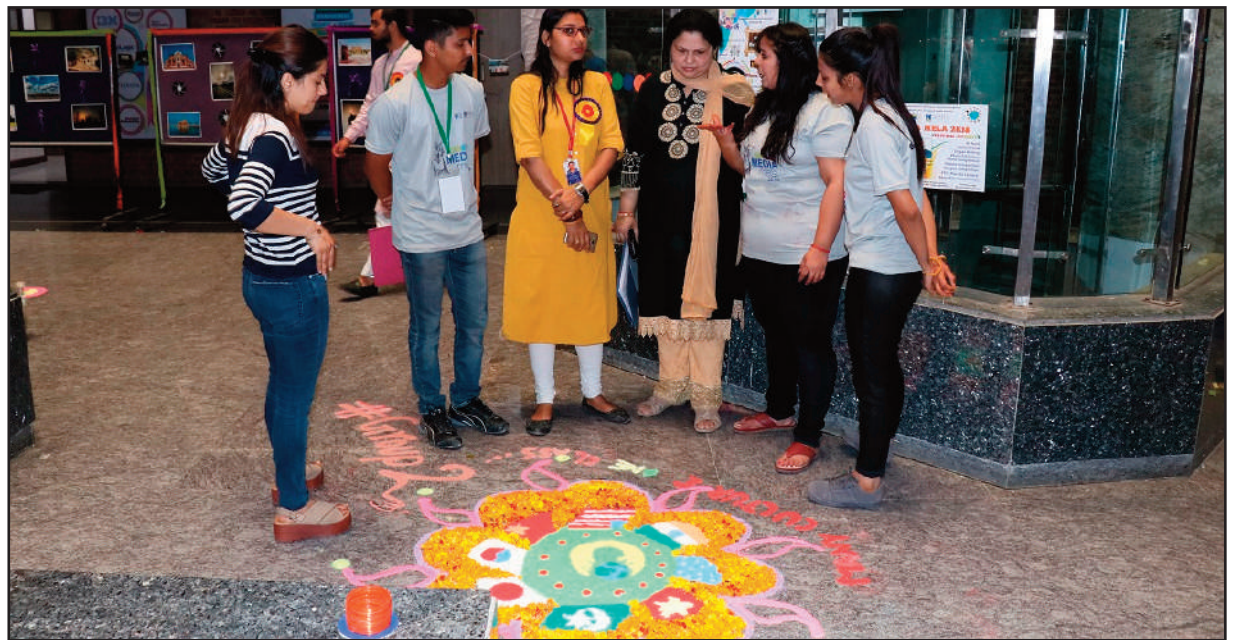
Rangoli Competition: Participants describing their desing to the Judges