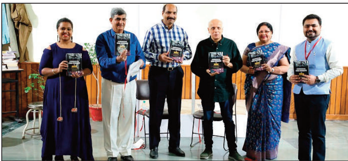
Mahesh Bhatt launching "Commercial studio of photography in India" along with higher dignitaries

With this, the media extravaganza came to a successful conclusion until next time.