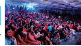
Students enjoying Fresher's eve

On 22nd of September 2017, Sharda University organized a Fresher's Party. The party was organised to welcome the new batch of students. The children were quite excited and participated in the event on a huge level, rain was creating interruptions in between, but it couldnt lower the enthusiasm of students.