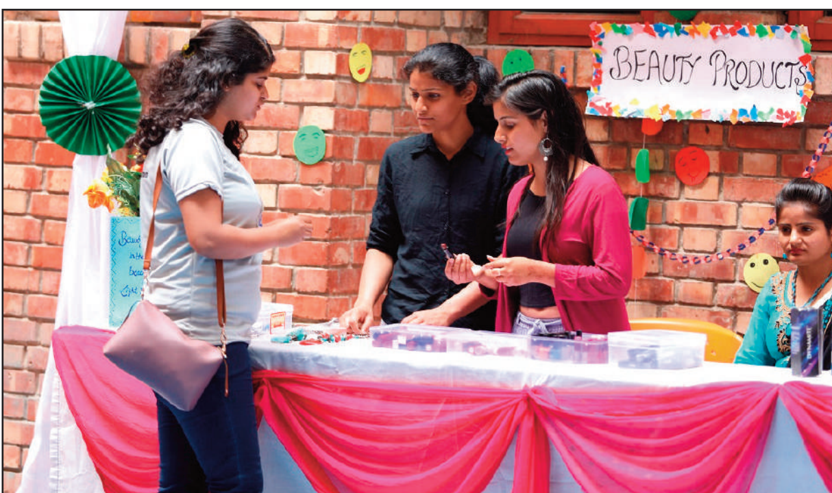
Students putting up stalls in Media Mela 2K18