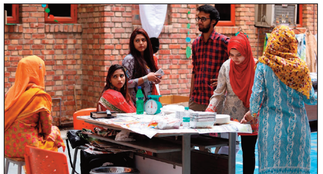
Depiction of marketing skills by students