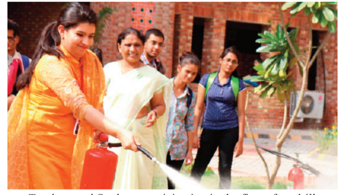
Teachers and Students participating in the fire safety drill