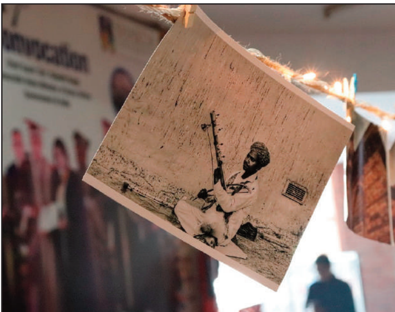
An exhibit of photo exhibition