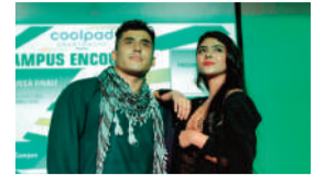
Fashionistas at Freshers