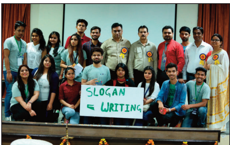
Students along with faculty in Slogan writing competition