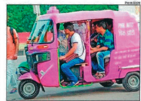
ALL THAT'S WRONG WITH PINK AUTOS

"The frequency of their availability has decreased now. Initially, drivers were certified and we had good rapport. There even were separate lanes for pink autos.