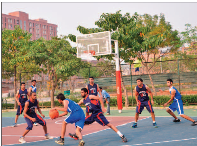
Teams in action in the Anand Swarup Memorial Annual Sports Meet held at Sharda University

Overall, Sharda University stood on top by winning seven of the nine events. This was the third annual sporting event that Sharda organised. Until last year, it was called The Sharda Cup.