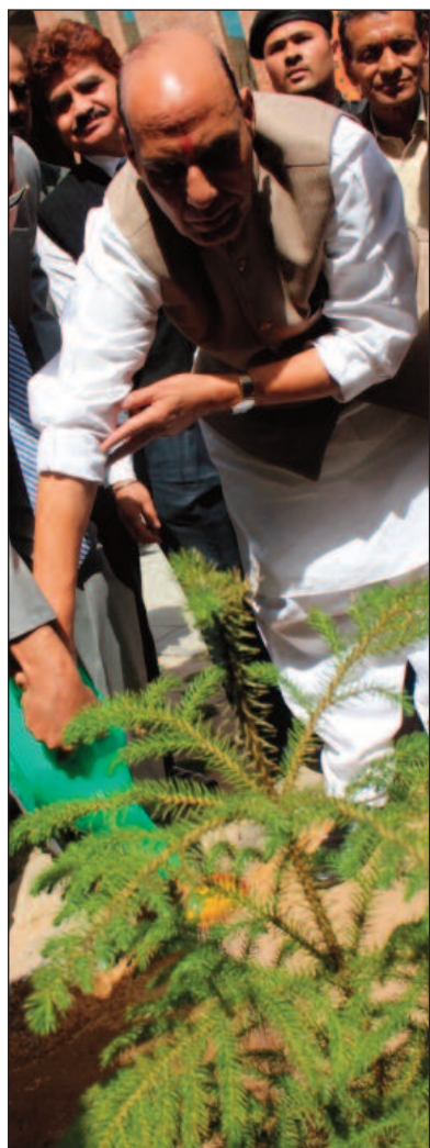
Mr. Rajnath Singh planted a tree during his visit to the Sharda campus.