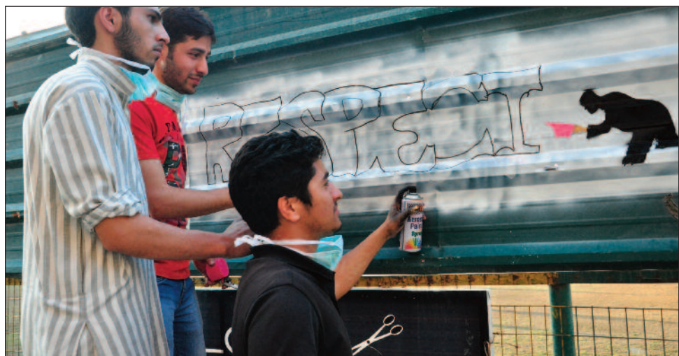
Students make graffiti in front of Mandela Hostel as part of a competition during the ongoing Cultural Meet.