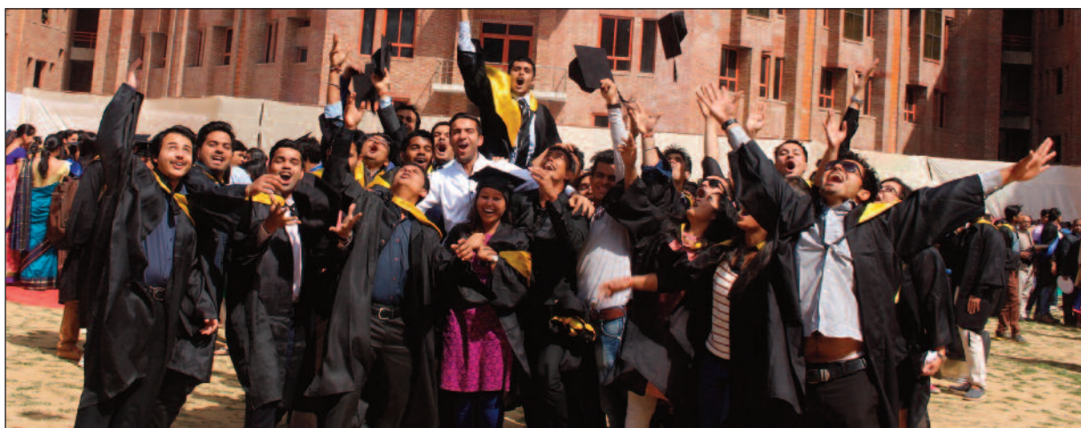
Students elated after getting degrees. They join in the traditional custom of throwing their hat.. (Below) Students await their turn to receive their honours.