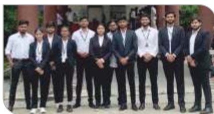
Para Legal Volunteers from the Pro Bono Club, Sharda School of Law, Sharda University, actively participated in the National Lok Adalat on 14th Sep. 2024.