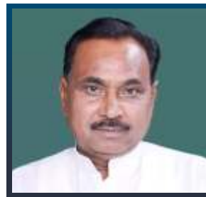
Shri Bhanu Pratap Singh Hon'ble Union Minister of State for MSME