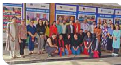
Students of the Pro Bono Club, Sharda School of Law, actively participated in raising awareness on the "Swachata Hi Sewa" campaign across Sharda University.