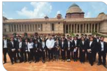
Sharda School of Law, Sharda University organised an enrich Educational student visit to Rashtrapati Bhawan in August 2024 .