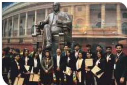
SSOL Para Legal Volunteers were honored by Chief Guests Hon'ble Vice President Shri Jagdeep Dhankhar, Hon'ble Attorney General R. Venkataramni, & Hon'ble Law Minister Shri Arjun Ram Meghwal.