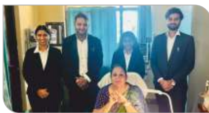
Para Legal Volunteers of Pro Bono Club participated in the National Lok Adalat Inauguration rally .