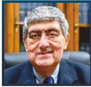
Hon'ble Justice Sanjay K. Kaul Former Judge, Supreme Court of India