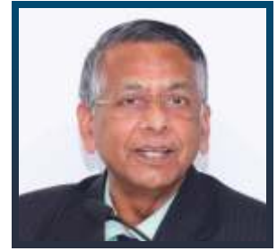
Shri R. Venkateramani Attorney General for India