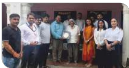
Students from Sharda School of Law, Sharda University, visited Bisrakh Village, Gautam Buddha Nagar , as part of the Community Connect initiative.