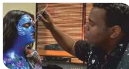
Pro Bono Club, Sharda School of Law is delighted to share the success of Intra-University Face Painting Competition on the theme "My Vision for India @2047" .