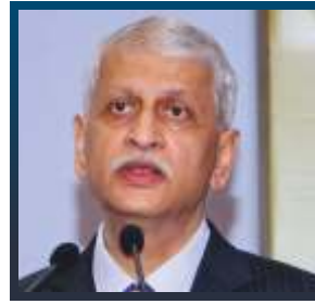
Hon'ble Justice Uday Umesh Lalit Former Chief Justice of India and Executive Chairman, NALSA