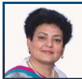
Hon'ble Rekha Sharma Chairperson, National Commission for Women, New Delhi