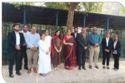
Pro Bono Club, SSOL, in collaboration with the Ministry of Law/Justice/the District Legal Services Authority, participated in the inauguration of Children Carnival, 2024 Allahabad High Court.