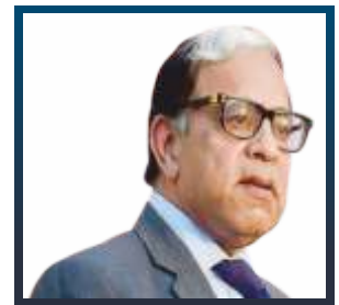
Hon'ble Justice A. K. Sikri Judge, Singapore International Commercial Court, Former Judge, Supreme Court of India