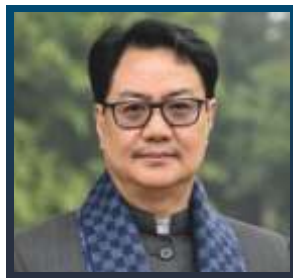
Shri Kiren Rijiju Former Minister of Law and Justice of India