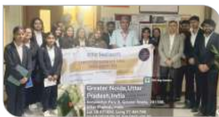
Financial Literacy Cell of Sharda School of Law organized an awareness visit to Village Mohiyapur on 19th November 2024.