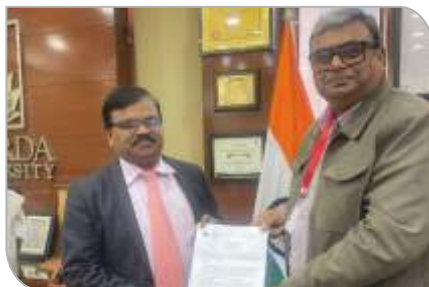
Sharda School of Law, Sharda University, and Chicago-Kent College of Law have signed a landmark MoU to strengthen scholarly and cultural collaboration.