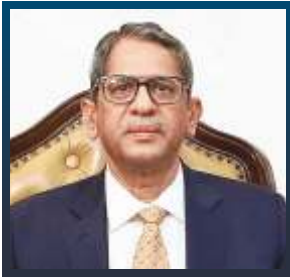
Hon'ble Justice N. V. Ramana Former Chief Justice of India