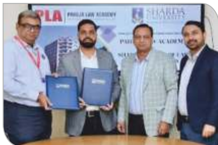
Sharda School of Law, Sharda University signed (MOU) with Pahuja Law Academy, Delhi .