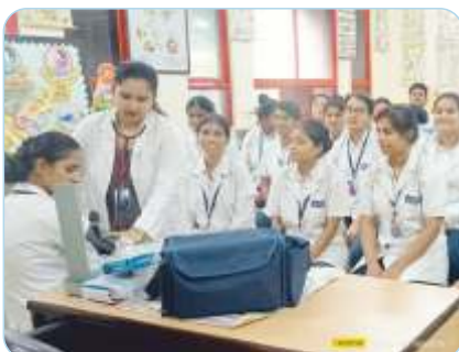
Community Health Nursing Lab