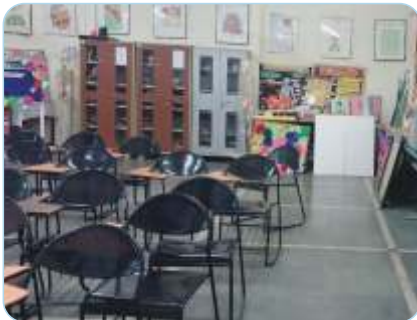
AV Aids Lab