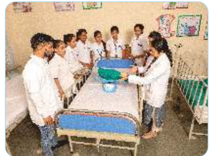
Child Health Nursing Lab