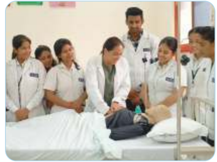
Adult Health Nursing Lab