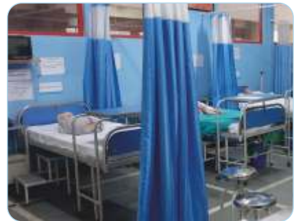
Advance Skill Lab