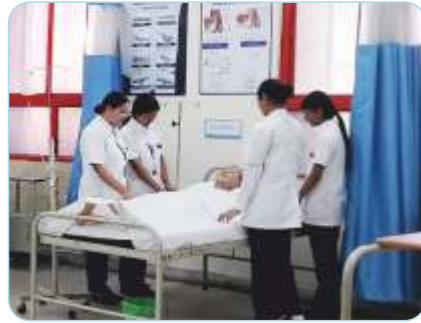
Nursing Foundation Lab