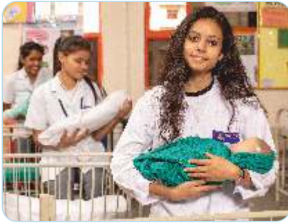
Child Health Nursing Lab