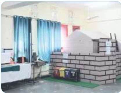
Community Health Nursing Lab