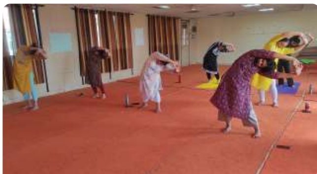
Yoga classes for Shardans - Sunrise Yoga & Twilight Yoga