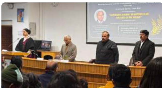
Manan Manthan Lecture series Exploring Ancient Traditions & Cultures of the World