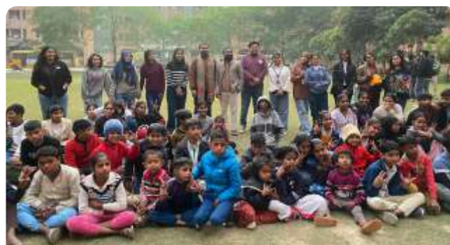
AAROHAN an Ascent in Emotional & Social Awareness