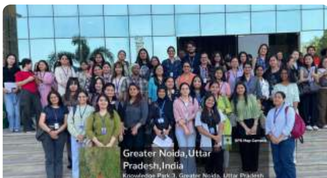
Greater Noida, Uttar Pradesh, India Knowledge Park-3, Greater Noida, Uttar Pradesh Gunj Hai, Connecting with Community for Inclusive Growth