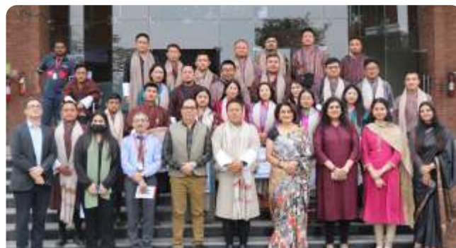
Substance Abuse Training Program 2024-25 For the Royal Government of Bhutan