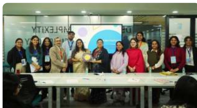
Pre Conference Workshop on Fundamentals of Somatic Psychotherapy