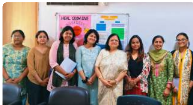
60 - Hour Internship in Clinical & Counselling Psychology