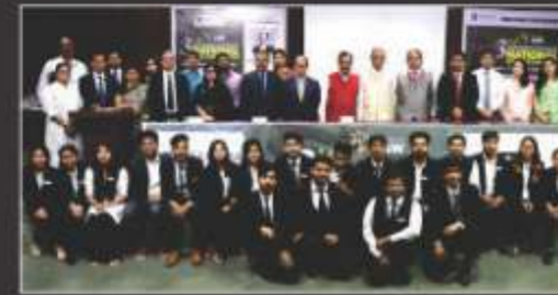
Hon'ble Mr. Justice A.K. Sikri, Judge, Supreme Court of India, Chief Guest in Valedictory Session in National Moot Court Competition 2018