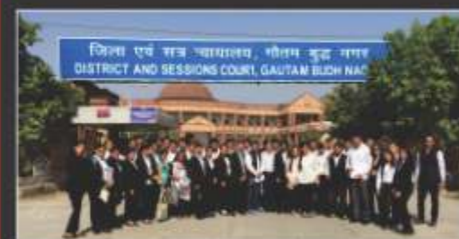
Visit to District & Sessions Court