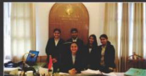
Internship at National Green Tribunal