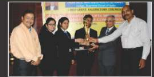
Hon'ble Mr. Justice P.C. Pant, Judge, Supreme Court of India distributing Trophy to Winner Team in National Moot Court Competition, 2016