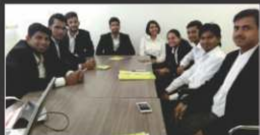
Internship at Delhi State Legal Services Authority