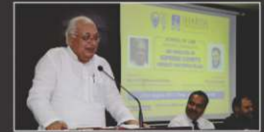
Mr. Arif Mohd. Khan, Former Cabinet Minister (Rajya Sabha)