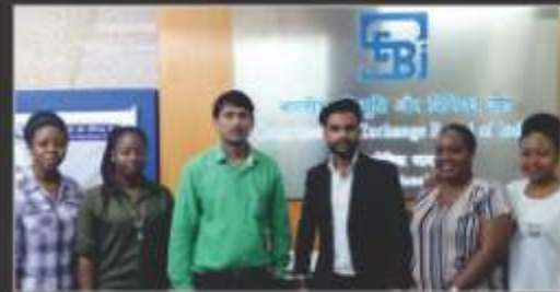
Workshop at Securities and Exchange Board of India, New Delhi