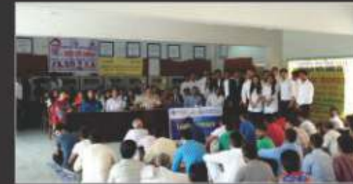
Legal Literacy Camp at Prison