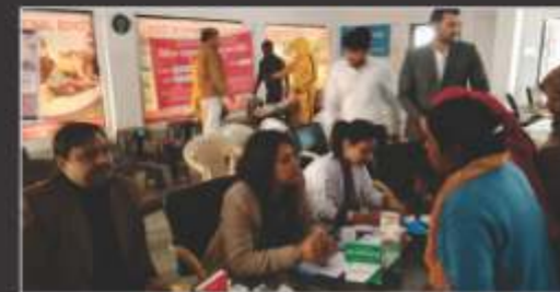
Free Medical Aid for Inmates Women & Children