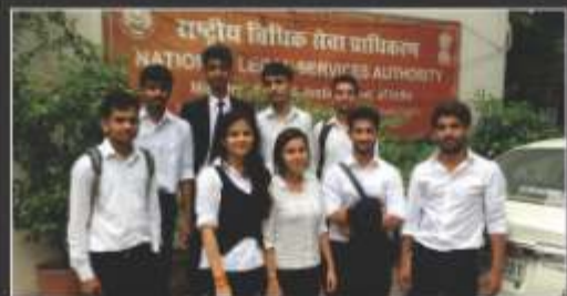
Internship at National Legal Services Authority