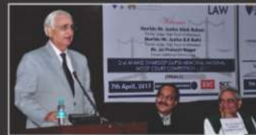
Hon'ble Mr. Salman Khurshid, Senior Advocate, Supreme Court of India, Former Cabinet Minister