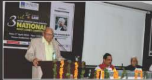
Hon'ble Mr. Ram Jethmalani, Member of Parliament (Rajya Sabha)