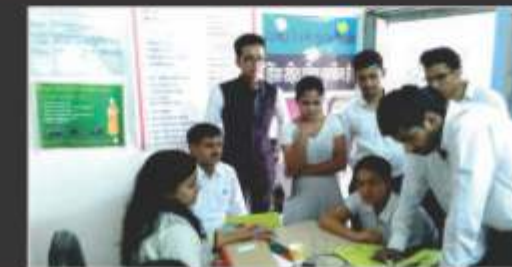
Legal Aid Camp at Community Centre