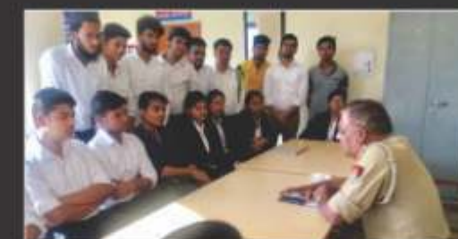
Police Station Visit