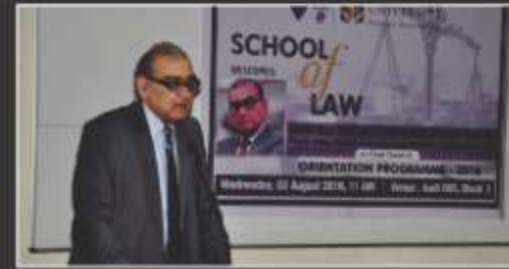
Hon'ble Mr. Justice Markandey Katju, Former Judge, Supreme Court of India