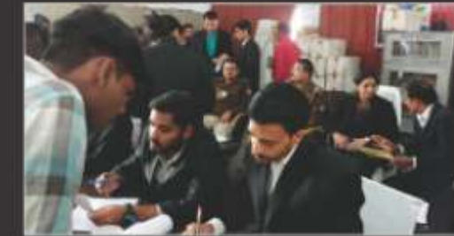
Legal Aid Clinic for Prisoners