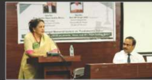
Hon'ble Mrs. Justice Gyan Sudha Misra, Former Judge, Supreme Court of India