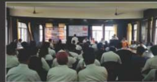
Legal Aid camp for Disabled Persons on Rights and Empowerment