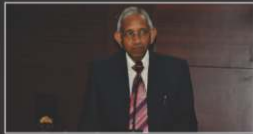
Hon'ble Mr. Justice R.C. Lahoti, Former Chief Justice of India