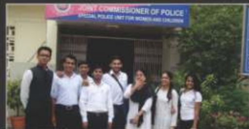
Internship at Office of The Joint Commissioner of Police