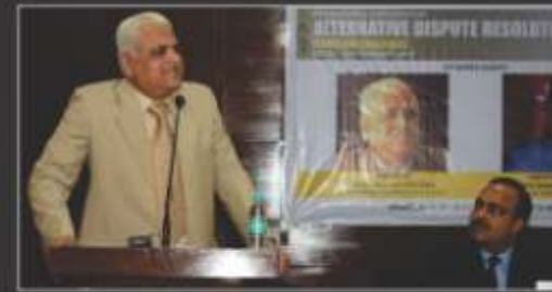
Hon'ble Mr. Justice A.R. Dave, Former Judge, Supreme Court of India