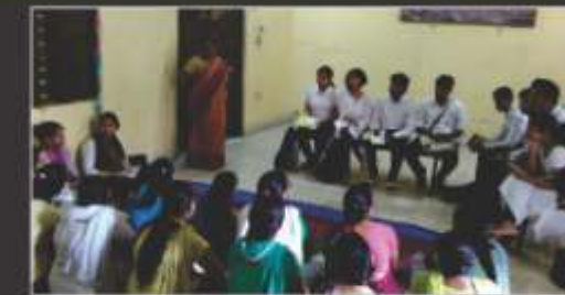
Legal Aid Clinic organised at Delhi State Legal Services Authority