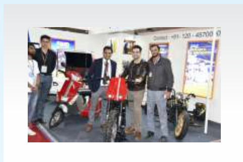
Appreciation by many dignitaries at Auto-Expo Greater Noida