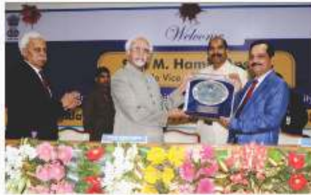
Former Vice President of India - Md. Hamid Ansari interacting with students