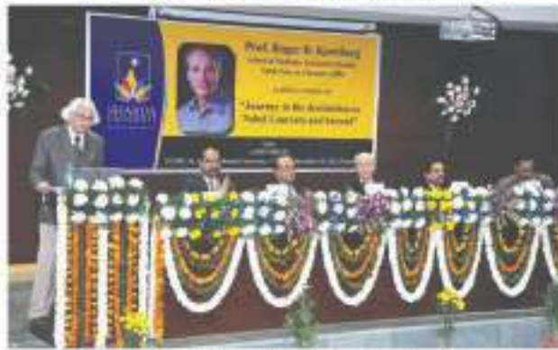
Nobel Prize Winner Prof. Roger D. Kornberg at Sharda University