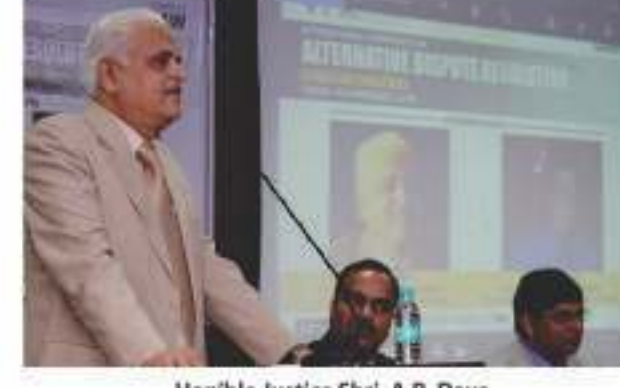
Hon'ble Justice Shri. A.R. Dave Former Judge, Supreme Court of India