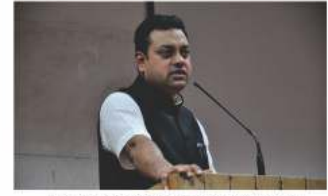
Dr. Sambit Patra, National Spokesperson of BJP