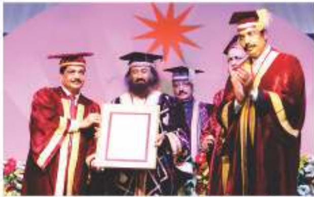
Chief Guest Gurudev Sri Sri Ravi Shankar Ji being felicitated during 2nd Convocation