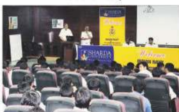
Indian Navy at Sharda University for campus recruitment