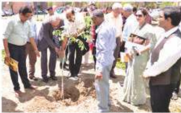
Hon'ble Justice Shri. Markandey Katju, Former Judge, Supreme Court of India, visited Sharda University Campus