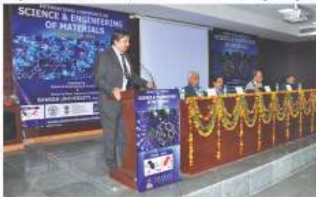
International Conference on Science & Engineering of Materials