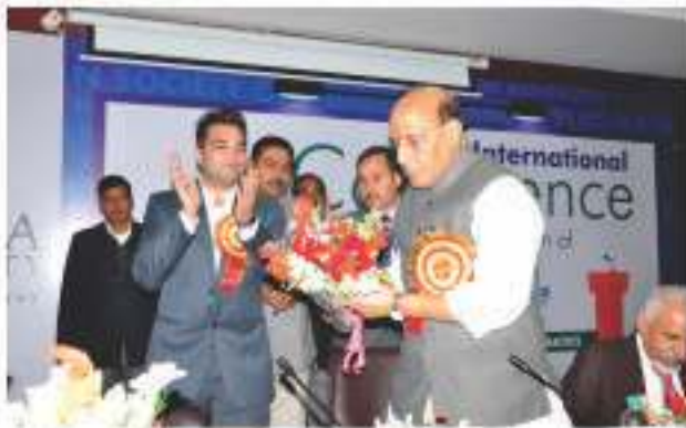
International Conference at SU Campus inaugurated by Mr. Rajnath Singh, Union Minister of Home Affairs