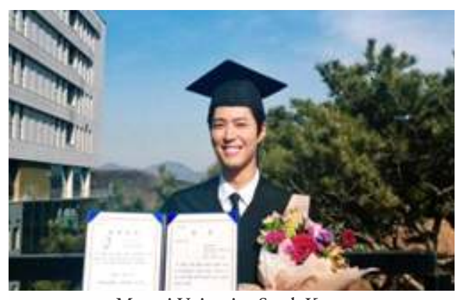
Myongi University, South Korea

Language Skills, be attractive to future employers, find new interests, make lifelong friends, develop their personality, get a life time experience, be ready for work, and pursue an international project in a foreign country.