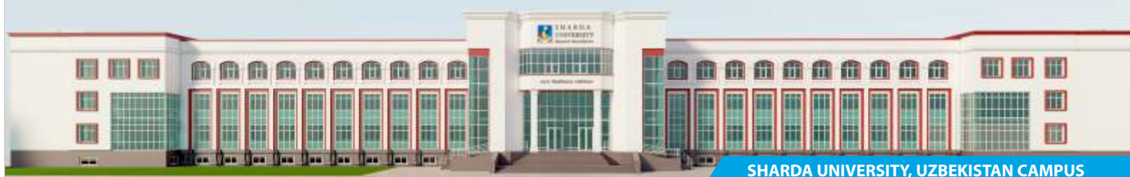
SHARDA UNIVERSITY, UZBEKISTAN CAMPUS