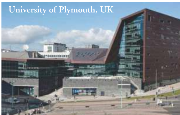
University of Plymouth, UK

Plymouth Business School is a part of the University of Plymouth's Faculty of Business. It has four departments of Accounting, Economics and Finance; International Shipping, Logistics and Operations; People, Marketing and Entrepreneurship; and Tourism and Hospitality. The School offers undergraduate and postgraduate (masters) degrees, is research active and works in partnership with industry and organizations across the world.