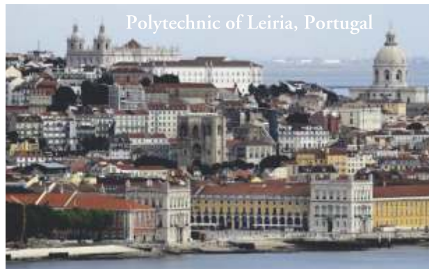
Polytechnic of Leiria, Portugal