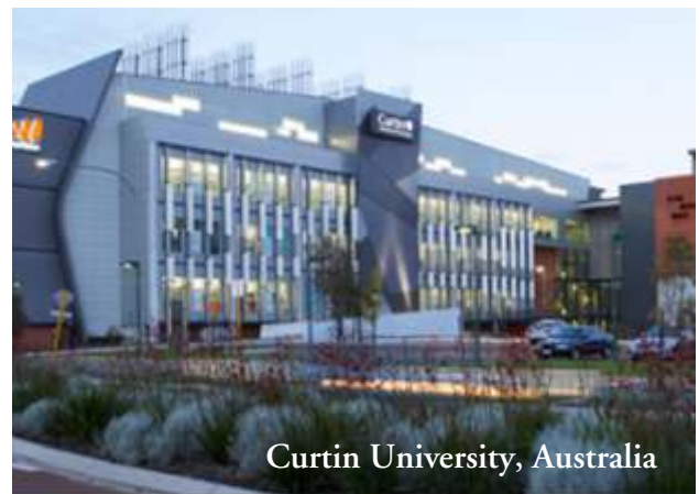
Curtin University, Australia

Letourneau University campus is in Longview, Texas, USA. The university is awarded Best Private University in North of Texas in 2017 from US News. Letourneau University is accredited by the Southern Association of Colleges and Schools Commission on Colleges to award associate, baccalaureate, and masters degrees.